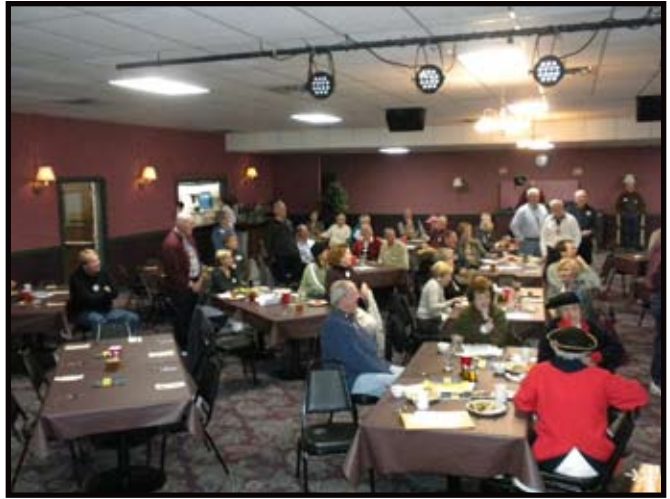
Recognizing our veterans and hearing when they served and for which armed service