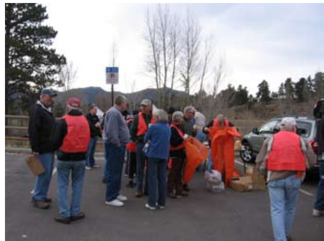
Participants for the River Clean Up