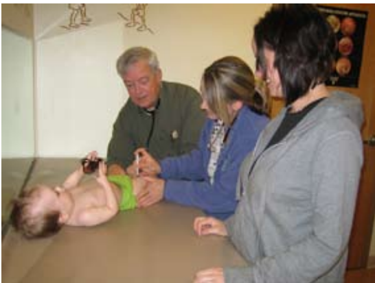
Photo taken at EPMC immunization