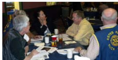
Club members participate in developing the vision for what areas the club should focus on in the future